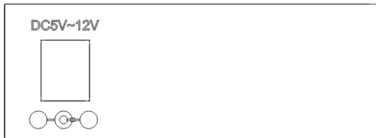
Fig.3 Rear panel